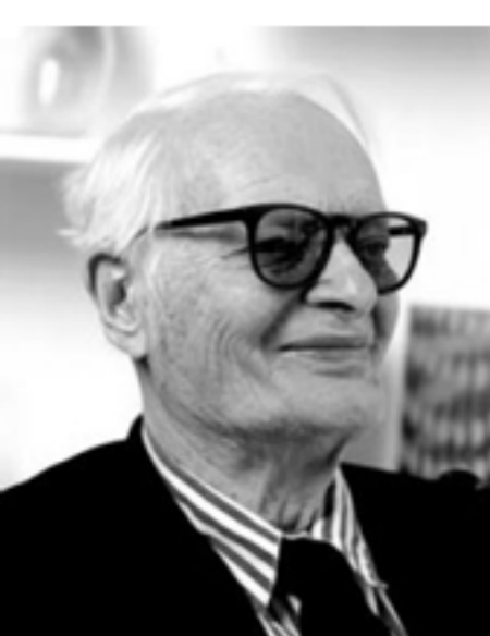
The Swedish architect and inventor of the famous String system, Nils Strinning was among a group of mid-twentieth century designers that helped to build the foundations of what we now call Scandinavian Design.

That's not surprising when you notice how cleverly Nils Strinning combined the inventor's demand for functionality with the aesthetes feeling for proportion and detail. The result is a timeless combination; at once classical and contemporary.